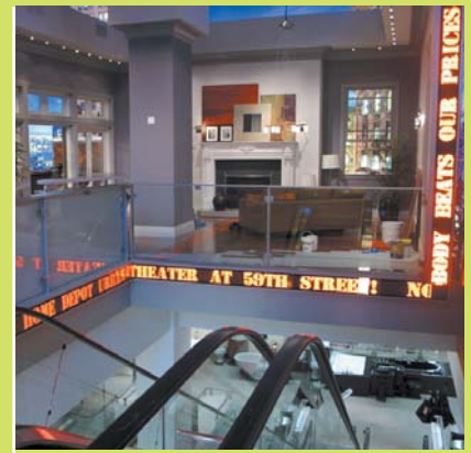
The Home Depot 59th Street “Urban Theater” Retail Experience, New York

Physical environments have a clear role to play in the total customer experience. Work and corporate environments influence employees and enable them to become more effective brand ambassadors. Briefing centers and tradeshow experiences enable business partners and clients to better understand products and more impactfully promote them within their organizations. Retail environments and events connect with consumers in a way that both promotes purchase and builds loyalty. And, needless to say, this spectrum of physical platforms can become a potent landscape of interconnected and mutually reinforcing experiences.