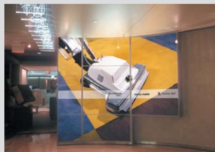
SERVICEMASTER CORPORATE ENVIRONMENT