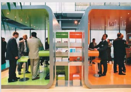
REUTERS BRIGHTSPOT TRAVELING PRODUCT EXHIBIT

Taking cues from urban theater, Jack Morton designed and installed a permanent yet flexible 1,400-square-foot lobby environment, a brand platform that merges retail environment design and entertainment for the New York customer. Designed to showcase products and provide a venue for live demonstrations, the environment—a prototypical prewar co-op apartment suspended within the entrance of the store—enhances brand messaging and is readily adaptable to seasonal, promotional and project-based marketing stories. The environment launched with a five-day, 12-hour-a-day event in which passersby could watch two actors, performing as do-it-yourself apartment owners, renovate their apartment with Home Depot products and services. An LED “zipper” and plasma screens broadcast brand messaging and aspects of the renovation project. Programs are in place to feature a range of interactive retail experiences throughout the year.