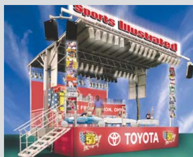
TOYOTA PRESENTS SPORTS ILLUSTRATED'S 50TH ANNIVERSARY TOUR