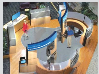
RETAIL KIOSK CONCEPT